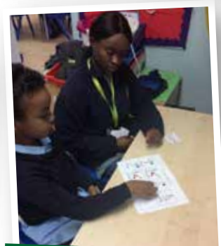
Here is Jama matching symbols for the emergency services.