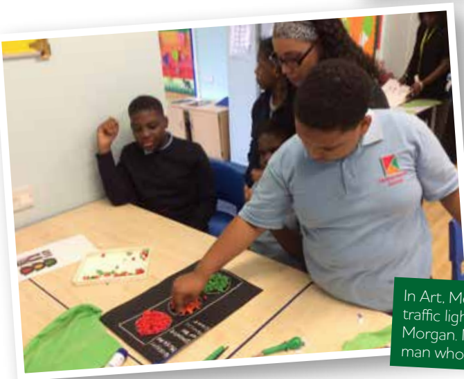
In Art, Medhane created a poster of a traffic light. This was to celebrate Garrett Morgan. Morgan was a famous black man who invented the traffic lights.